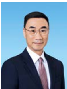
利子厚先生，JP 香港賽馬會主席