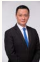
鄧飛議員，MH 立法會議員 Mr TANG Fei, MH Member of the Legislative Council