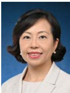
麥美娟女士, SBS, JP 民政及青年事務局局長

Miss Alice MAK, SBS, JP Secretary for Home and Youth Affairs