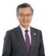
林正財議員, SBS, JP 行政會議非官守成員 Dr LAM Ching-choi, SBS, JP Non-Official Member of the Executive Council